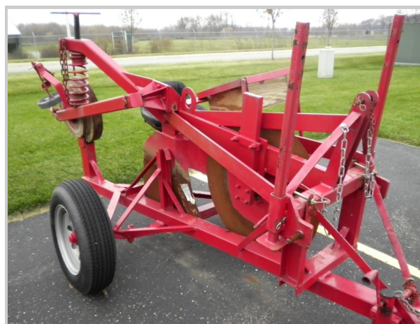
The new tree planter available for rent ▶