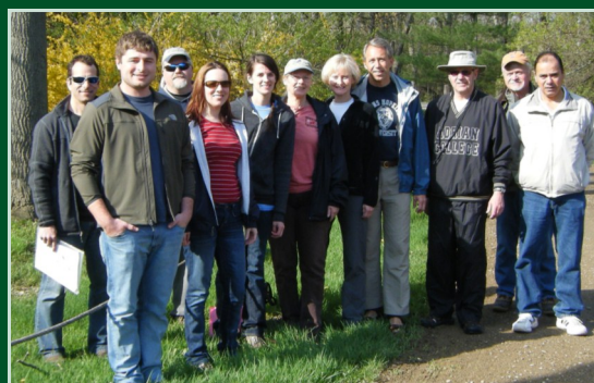
Spring Collection Day volunteers.

In July 2011, the MiCorps grant for the Upper Grand River Adopt-A-Stream Program came to an end and the program coordinator, Alison Rauss, completed her two-year position with JCCD. Luckily, the program will continue in 2012 with funding from the Upper Grand River Watershed Alliance and the MS4 communities.