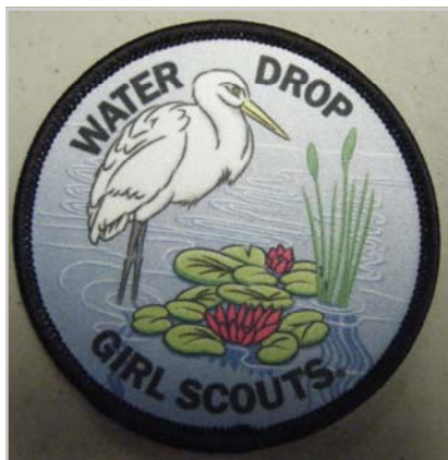
▲ The Water Drop patch through the E.P.A.