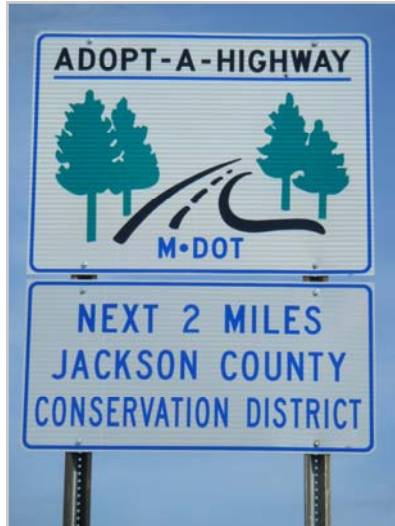
Our sign on I-94.

JCCD felt that the Adopt-A-Highway program fit in perfectly with our organization's mission, so we are now responsible