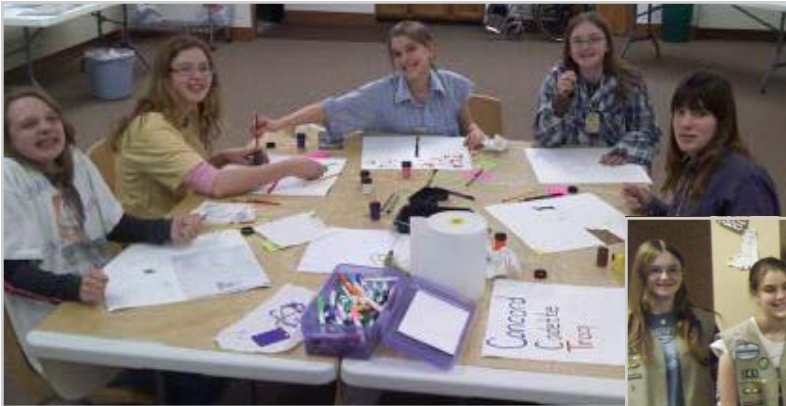
▲ Girl Scout Troop 245 working on the watershed banner at the Dahlem Center.

▼ The “Lending a Hand to Keep it Grand” banner includes stewardship messages about proper lawn care, using native plants, and even picking up pet waste.