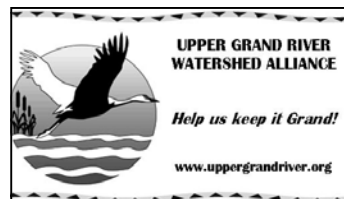
Our new sticker design.